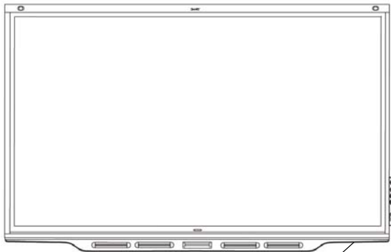
Serial Number Location

To make sure that you have the correct service parts diagrams, you must verify the serial number of your SBID-7275P. The serial number of the flat panel display will be located on the right underside of the bottom bezel. The serial number of the AM40 will be located on the bottom of the appliance. An example of the serial number format is shown below.